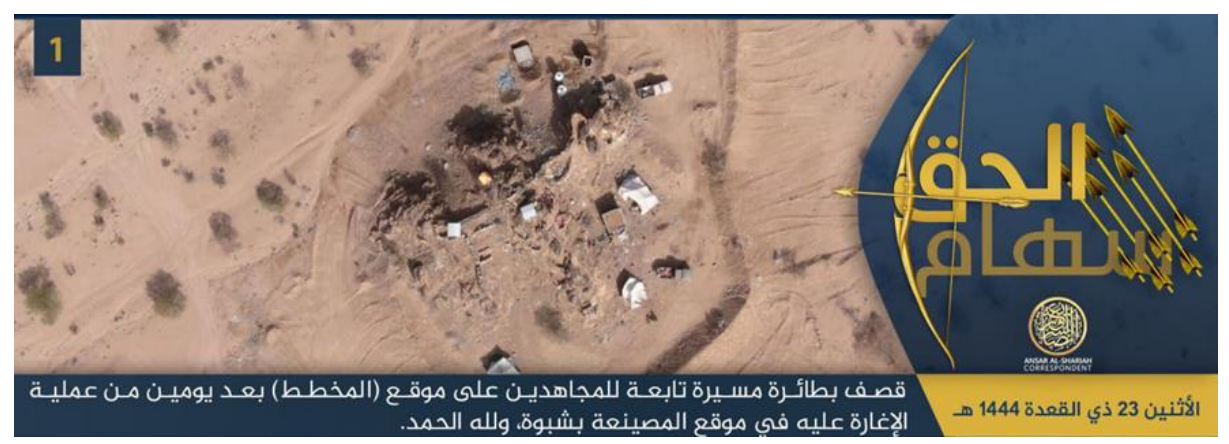
An aerial photo published by AQAP which said that it was taken during a drone bombing of a site affiliated with the Shabwa Defense Forces in Al-Masaniah, June 14, 2023.

The difference in the latest AQAP terrorism attacks against the Shabwa Defense Forces - which are part of the Southern forces - over the past few months is that the group for the first time used explosive-laden drones. Such weapons can pose a danger not only to foreign attachés but to local political, sovereign, and military facilities but also to the ships sailing in the Red Sea and territorial waters. This comes alongside the current threats posed by the Houthi militia. The dangers posed by AQAP may increase if it manages to develop its tools. The group bears unbridled hostility towards the international community and doesn't recognize laws or rules of war.<sup>24</sup>