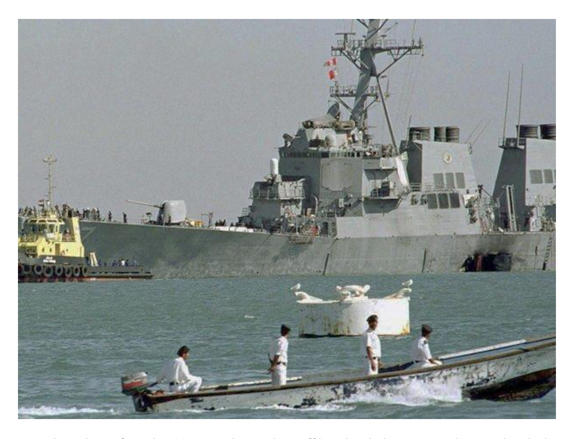
An archive photo of October 29, 2000, shows a boat affiliated with the Yemeni police pass beside the stricken 'USS Cole' while being pulled from the Port of Aden by Yemeni tugboats to the deep waters following an AQAP suicide attack