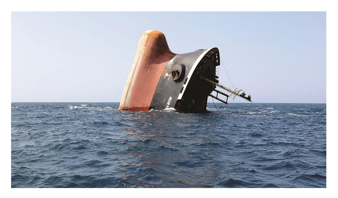
British ship 'Rubymar' that sank off the Mocha coast in the Red Sea, two weeks after Houthis attacked it on February 18, 2024