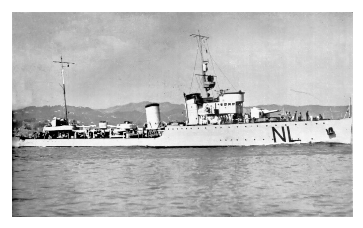
Italian destroyer 'Francesco Nullo' which served during the 2nd World War. It was based in the Red Sea off the Italian colony of Eritrea and participated in military attacks there.