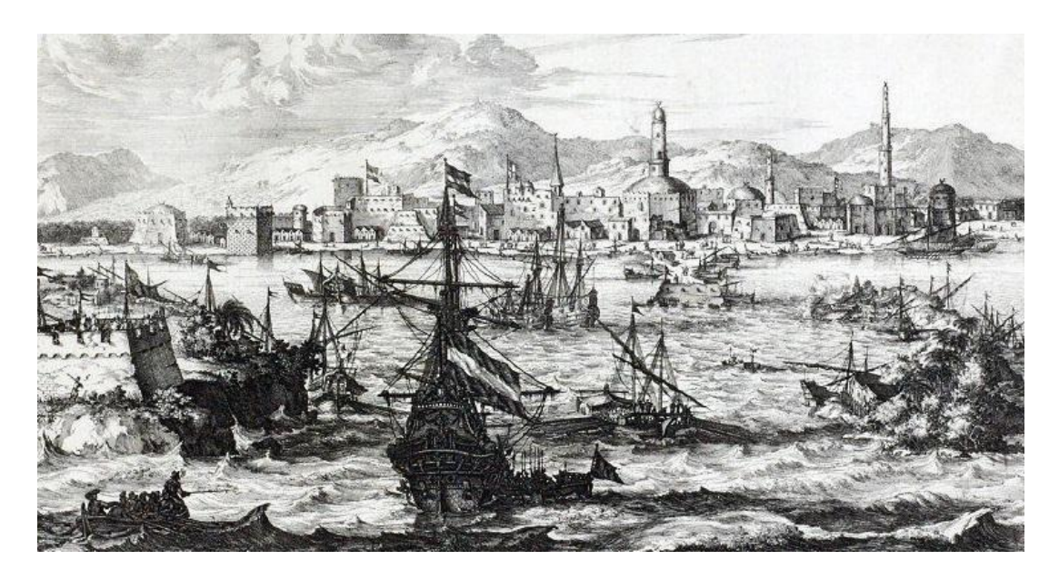
British and Dutch commercial centers in the Yemeni city of Al-Mocha