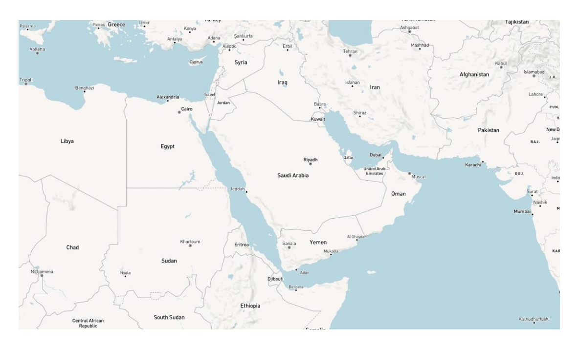
Illustrative map of the Red Sea and the Gulf of Aden (Mapbox)